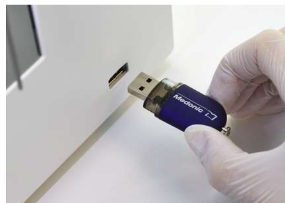
Medonic M-series M32 analyzer users enjoy improved data communication thanks to a broad selection of connectivity options.