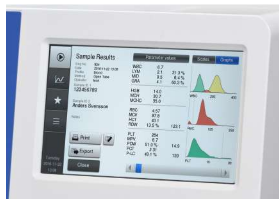
Modern user-interface. Its clean, uncluttered design promotes efficient operation and accurate assessment of results.

Medonic M-series M32 hematology analyzers are part of a Total Quality Concept that comprises instruments, reagents, quality control materials and service – an unbroken chain of know-how in quality hematology measurements.