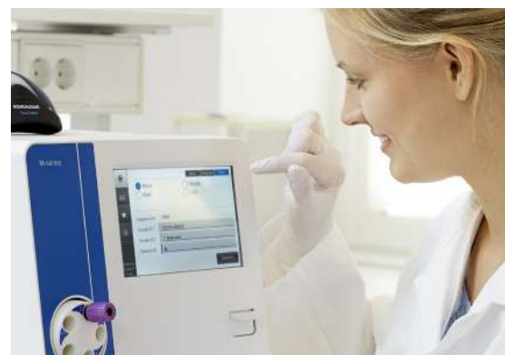
Improved software simplifies work processes and gives users better control of sample results and patient records.