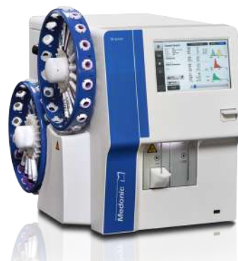
Medonic M32S – Autoloader for up to 2 x 20 samples. Just load and walk away.