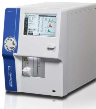
Medonic M32M – five-sample mixer is ideal for doctors' offices and small labs.