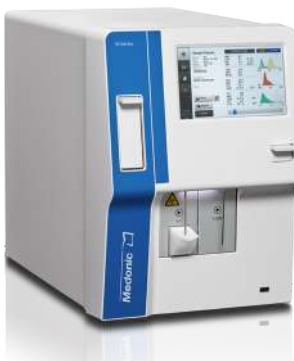
Medonic M32C – closed-tube sampling minimizes risks from contaminated blood.