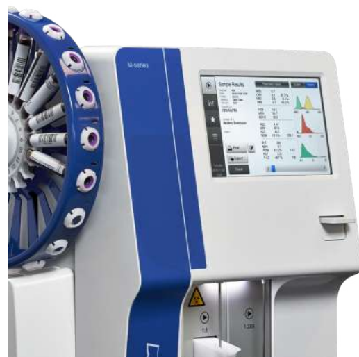
M-series M32S with Autoloader is ideal for small to medium-sized hospitals needing walk-away analysis functionality.