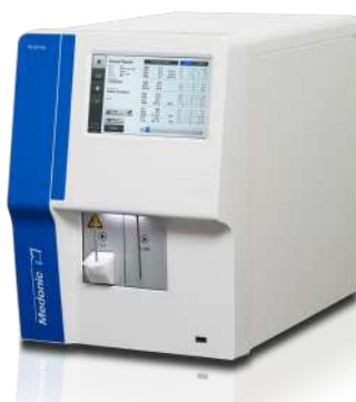
Medonic M32B – even the basic model includes shear-valve technology.

USB port is evidence of much improved connectivity and communication.