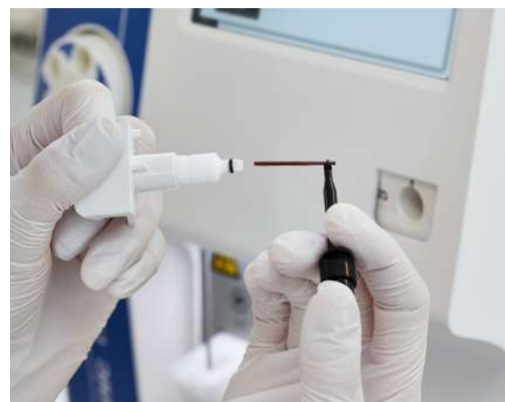
Medonic M-series M32 analyzers deliver a full CBC from just 20 µl of blood. Perfect for children and blood banks!

For these occasions, the M32S with Autoloader is the ideal instrument to have on your bench. As the top-of-the-range model in the M32-series, it's the perfect walk-away analyzer and ideal for many small to medium-sized hospitals. Just pre-load up to 2 x 20 samples and let it do the work!